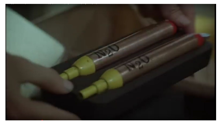
Fig. 1. The cylinders.

To answer this question, assume that the gas cylinders are standard cylinders used for medical purposes, and they are full. Estimate their actual size from the attached picture. The concentration of N_2O in air that is necessary to provide a desirable effect can be googled. If, according to your estimate, the amount of N_2O is too small or too big, how many cylinders of that size should the hero have used to achieve a desirable result?