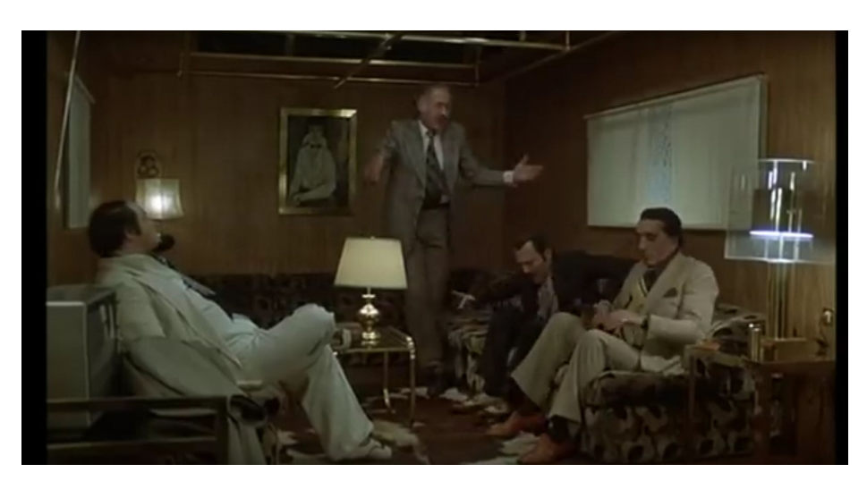
Fig. 2. The trailer. For your estimate assume one half of the trailer is seen on the picture.